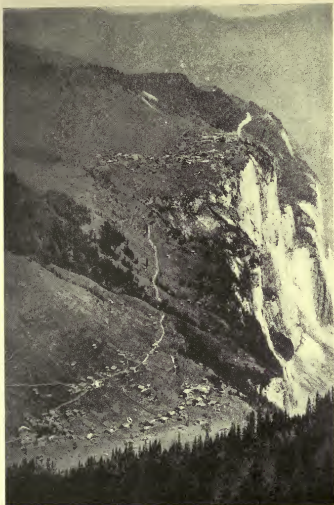
MÜRREN, SWITZERLAND—THE UPPER VILLAGE ON THE EDGE OF THE PRECIPICE.