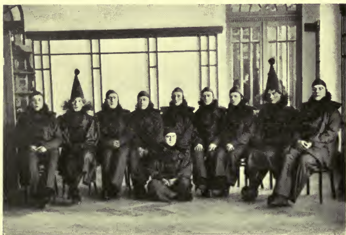
MÜRREN VARIETY ENTERTAINMENT COMPANY AND PIERROT TROUPE, COMPOSED ENTIRELY OF INTERNED PRISONERS.