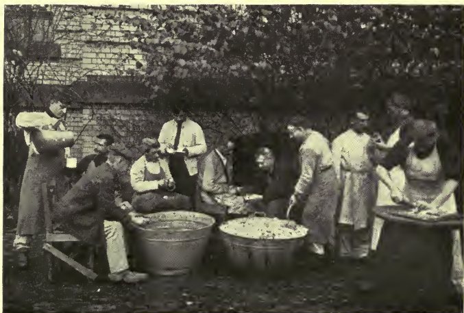
FRENCH AND RUSSIAN PRISONERS PEELING THE DAY'S SUPPLY OF POTATOES FOR LAZARETT VI.