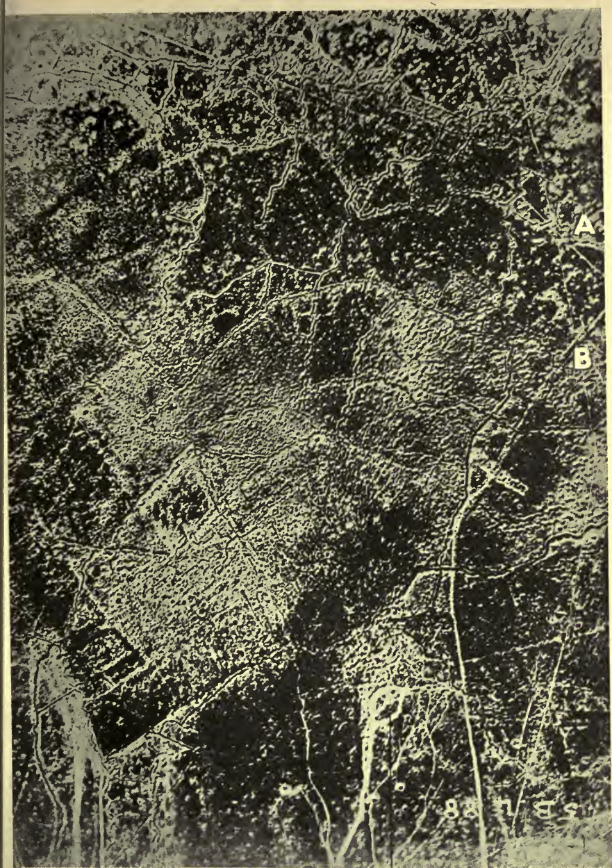
GERMAN AERIAL PHOTOGRAPH TAKEN JUNE 3RD, 1916, AT HEIGHT OF 7,500 FEET OF SECTION OF TRENCHES IN SANCTUARY WOOD, SHOWING THE RESULTS OF THE BOMBARDMENT OF JUNE 2ND. AT "A" ARE THE GERMAN FRONT LINE TRENCHES, AND AT "B" ARE THE BRITISH FRONT LINE TRENCHES. THIS PHOTOGRAPH WAS FOUND AMONG THE EFFECTS OF A CAPTURED GERMAN OFFICER