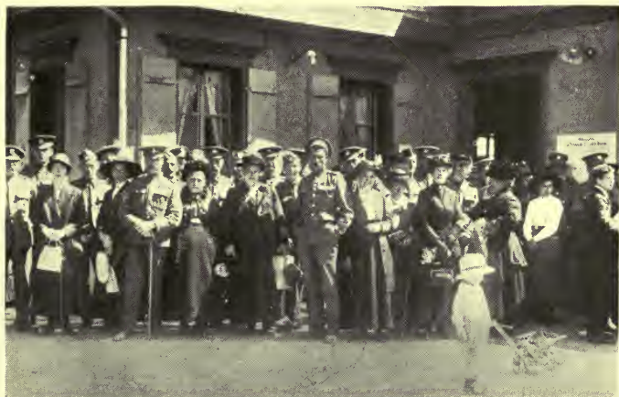
REUNION, IN SWITZERLAND, OF TOMMIES WITH THEIR WIVES AND MOTHERS AFTER THREE YEARS' SEPARATION.