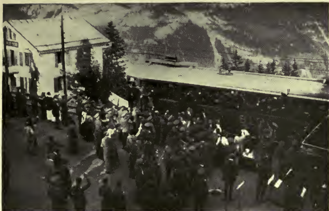
DEPARTURE OF REPATRIATED PRISONERS FROM MÜRREN.