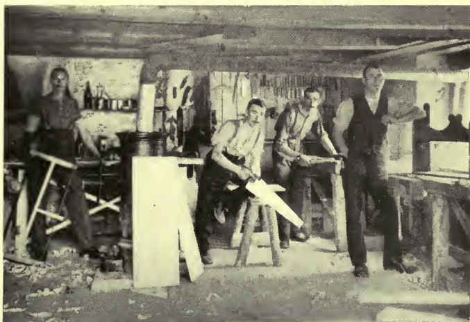
CARPENTER'S SHOP. A CORNER OF THE SHOP WHERE MEN WERE TAUGHT THE USE OF SAW AND HAMMER.