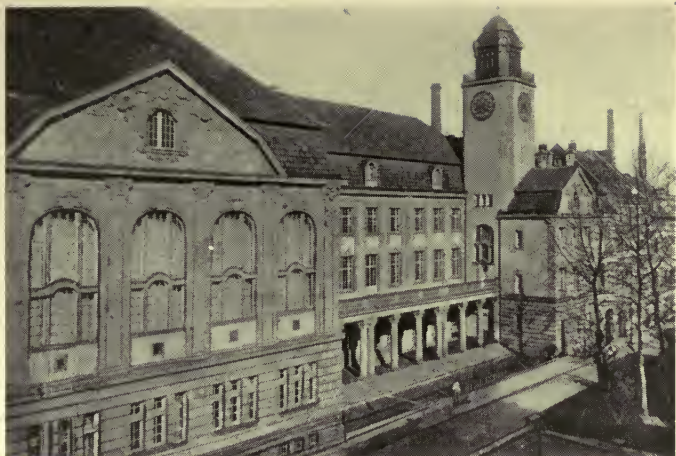
LAZARETT VI, COLOGNE.