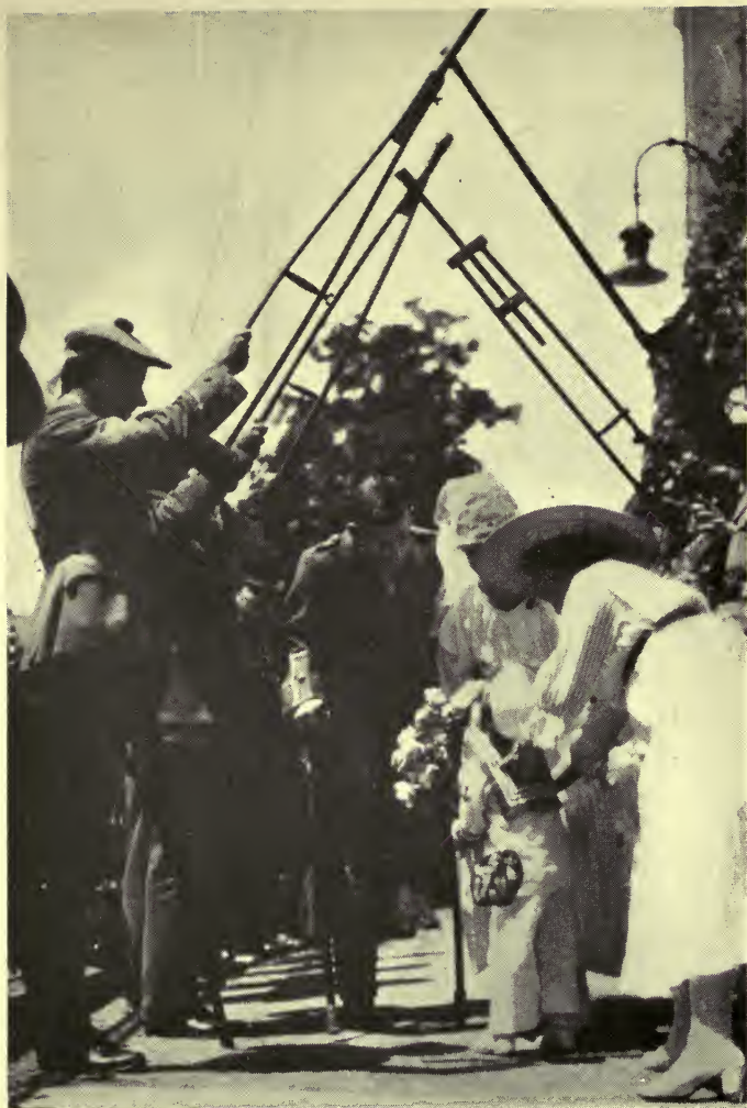
THE WEDDING OF LIEUT. HEDGES.